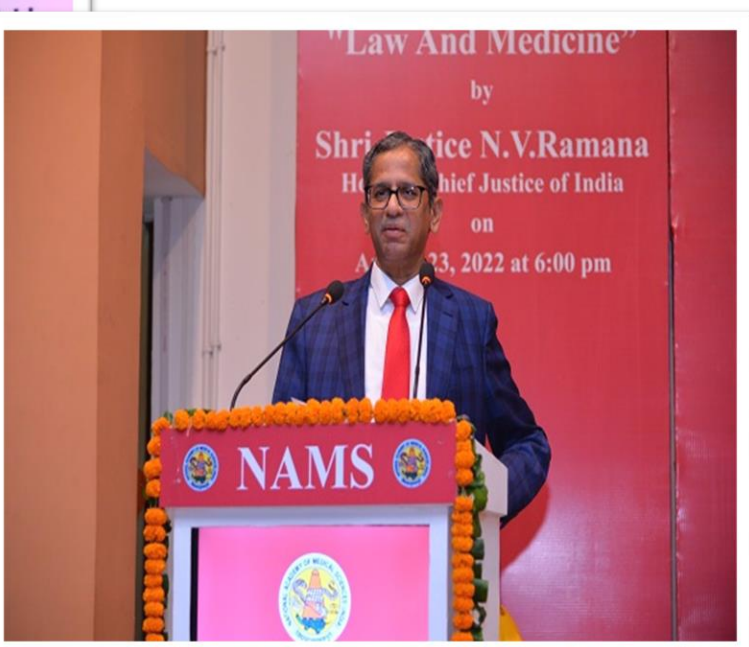
Address by Shri Nuthalapati Venkata Ramana Hon'ble Chief Justice of India

Address by Chief Guest Hon'ble Governor of Karnataka, Shri Thawar Chand Gehlot