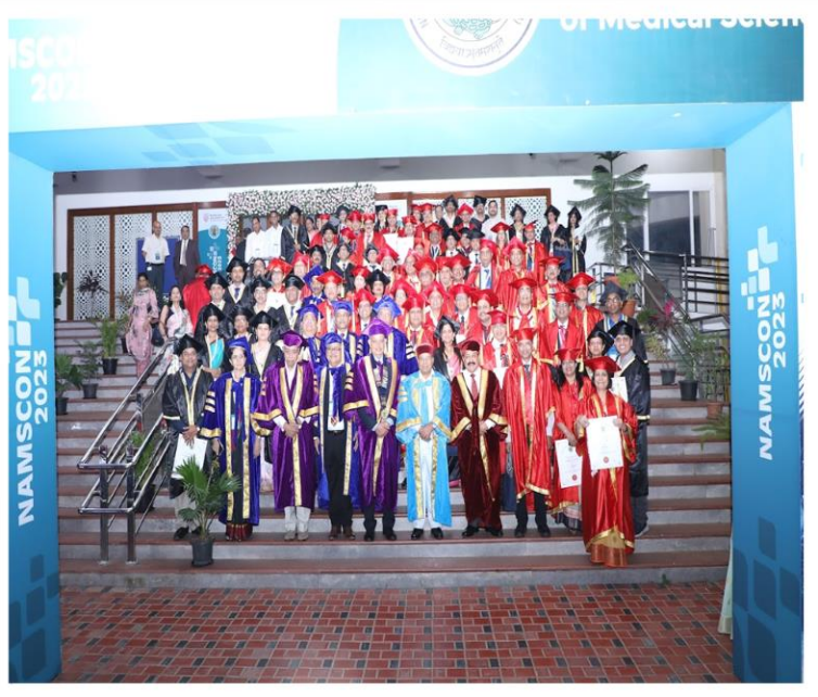
Newly Elected NAMS Fellows, Members Associate Fellows 2023