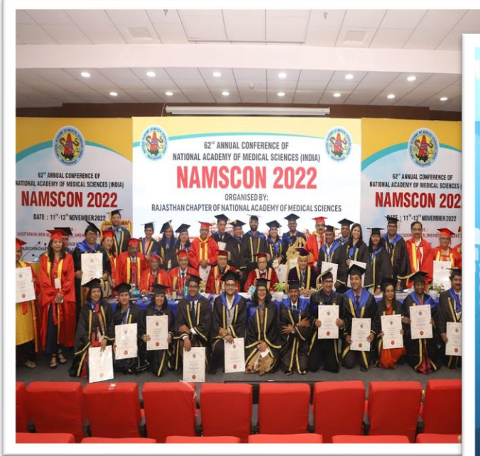
Newly Elected NAMS Fellows, Members Associate Fellows 2022